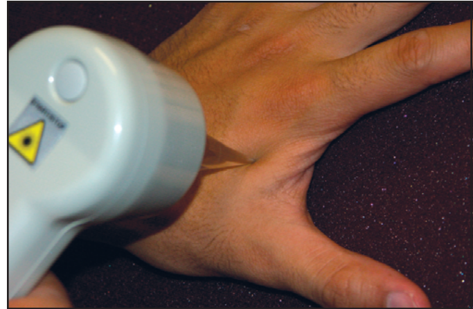
FIGURES 5. Acupoint stimulation of LI4 with special acupoint probe.

of studies performed on laser stimulation of acupoints. 16 The emitter or probe can be placed over the acupoint or a special acupoint probe may be used, if available (see Figure 5). Clinical experience has shown that the more of these three techniques are combined together during treatment sessions, the faster and more long lasting are the results.