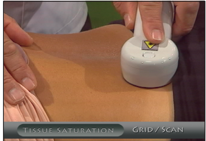
FIGURES 2 AND 3. Treatment of lumbar paraspinous muscles.

There are a few exotic devices that use unusual wavelengths. One interesting device utilizes a cluster of various wavelengths 700nm and 2,000nm IR.